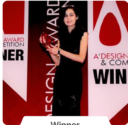
Winner International 'A Design Award'