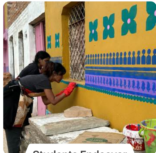
Students Endeavor Craft Village Pranpur (Chanderi)