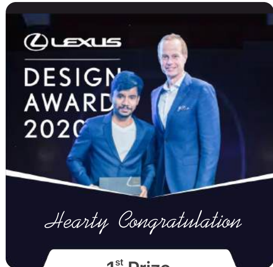
1 st Prize Lexus Design Awards India