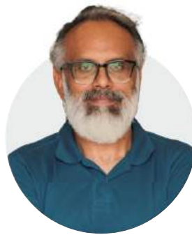
Ayon Sarkar Visual Communication