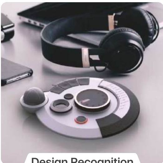
Design Recognition Yanko Design