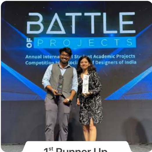
1 st Runner Up Pune Design Festival